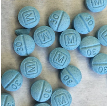
FAKE FENTANYL PILLS